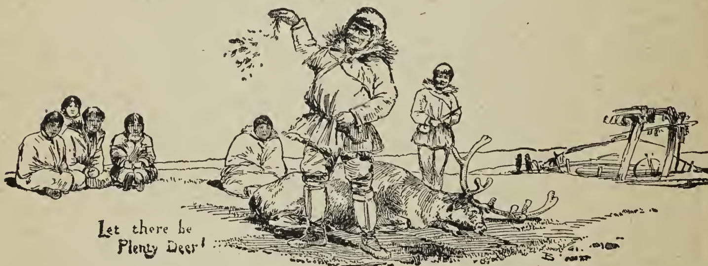
Superstitious ceremony connected with killing or selling reindeer in Siberia.

In 1891 the sixteen reindeer purchased average $10.25 each. This last season the general average was brought down to $5 each.